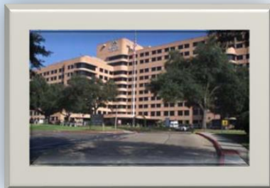
Overton Brooks VA Medical Center