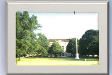
Veterans Health Care System of the Ozarks