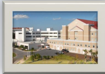
Gulf Coast Veterans Health Care System