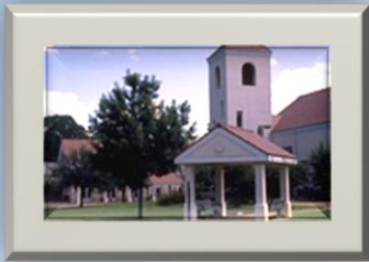
Alexandria VA Health Care System