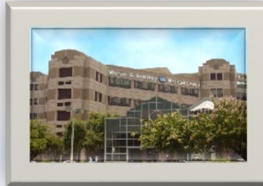
Michael E. DeBakey VA Medical Center