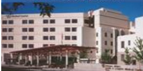
VA Pacific Islands Health Care System, Honolulu, HI