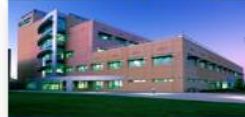
VA Central California Health Care System, Fresno, CA