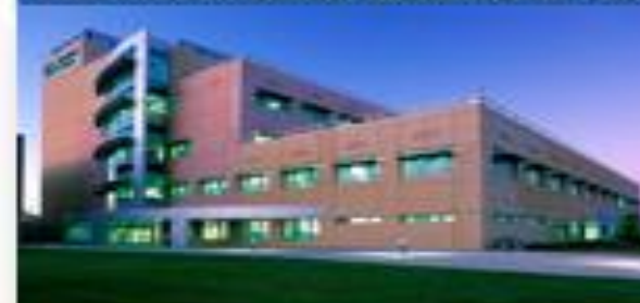
VA Northern California Health Care System, Sacramento, CA