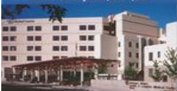
VA Sierra Nevada Health Care System, Reno, NV