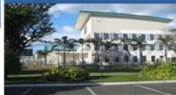
VA Outpatient Clinic, Manila, Philippines

The VA Sierra Pacific Network is one of 21 Veterans Integrated Service Networks in the Veterans Health Administration (VHA). It serves 1.2 million Veterans residing in Northern and Central California, Northern Nevada, Hawaii, the Philippines, and several Pacific Islands including Guam and American Samoa.