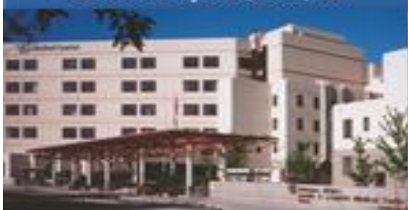
VA Sierra Nevada Health Care System, Reno, NV